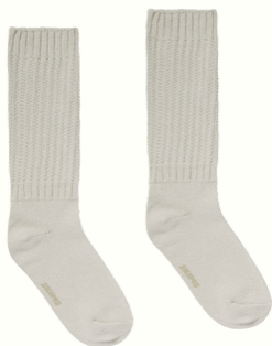
SKIMS Slouch Socks