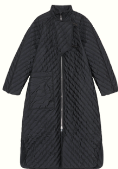
Ganni Recycled Polyester Parka Coat

Details: I am an 80's baby and have always loved the workout attire of that era, so it's no surprise I love a leg warmer. These are functional too for winter and easily fold over socks and sneakers.