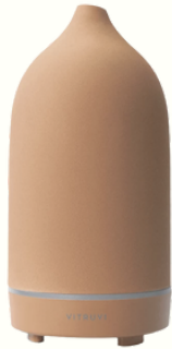
Terracotta Stone Essential Oil Diffuser