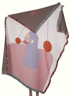
Slowdown Studio Hannah Throw Blanket

Details: My family did this puzzle during quarantine last year. We love it so much that it now is framed and displayed on our wall along with the kids drawings like an heirloom.