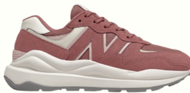
New Balance 57/40 Shoes in Washed Henna

Details: A perfect slouch sock for both warmth and style, and they come in amazing colors. I love how these look with sneakers. Worth getting on the waitlist.