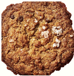
Brutus Bakeshop Miso Chocolate Chip Cookies

Details: Ceramics in the kitchen are my absolute favorite look. These grinders are incredible and can be used for the classic salt & pepper, but it's also powerful enough to grind nuts, seeds, spices and dried fruit.