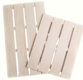
Hinoki Wood Bath Mat

Details: A diffuser as essential as the oils you put in it. Vitruvi has made the perfect diffuser that also doubles as a piece of art, and comes in other colors too. My favorite oils to use are Sleep and Boost.