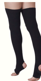
Live The Process Leg Warmers

Details: A perfect everyday lifestyle shoe to go with those slouch socks. This shoe works really well with workout attire, but also with trousers and a structured top. The color is perfection.