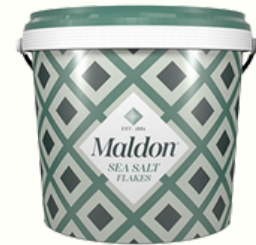
Maldon Sea Salt Tub

Details: This retro-looking bag is great for grocery shopping and a farmer's market haul. It's easy to clean, and breathable, and can double up as a beach bag.