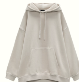
Oversized Hoodie Sweatshirt

Details: I have a love affair with all things The Frankie Shop. Coats, pants, sweats, you name it.