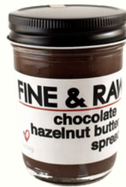
Fine and Raw The Full Spread

Details: Olive Oil is a great gift for someone who loves to entertain and cook. Brightland oils look beautiful and are equally as delicious. This is a duo set with Alive and Awake.