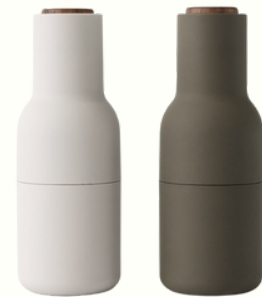
Menu Bottle Grinder

Details: I used to drive to Williamsburg to get my hands on this spread and now they ship! Everyone loves a sweet, plant-based and refined sugar-free spread. This is a set of all their flavors and my favorite is the dark chocolate hazelnut spread. My address is.. ha!