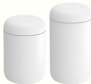
Fellow Carter Everywhere Mug

Details: I grew up playing Yahtzee with my family so this game takes nostalgia to a whole other level. Every family should own one, and it is great for people of all ages. Easy to take on the road too.