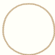
Gold Ball Bracelet 2MM

Details: I have this fanny pack in three colors. It is big enough to hold everything you want and need, and can be worn also as a crossbody.