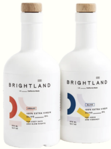
Brightland Olive Oil Duo set

A list of edible gifts and relatable items