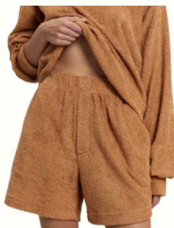
Frankie Shop Helia Lounge Shorts & Pullover