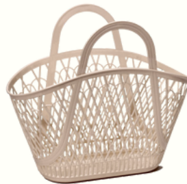
Sunjellies Betty Basket

Details: Cookies are my dessert of choice, and these are out of this world. Lani Halliday created these vegan, gluten-free, and soy-free cookies to perfection and they now ship!