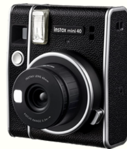
Fujifilm Instax mini 40

Details: I love a crystal bowl that can be used for so many different things, like an ashtray, jewelry tray, key tray, etc. This bowl is beautiful and has a chromatic film to reflect rainbow light in real life.