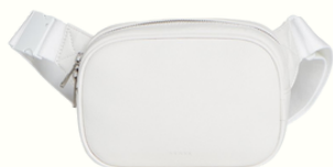
State Bennett Fanny Pack

Details: I am all about oversized sweatshirts and layering. This Zara one is just too good and affordable to not add it here. Comes in a few different colors and perfect under a bomber jacket.